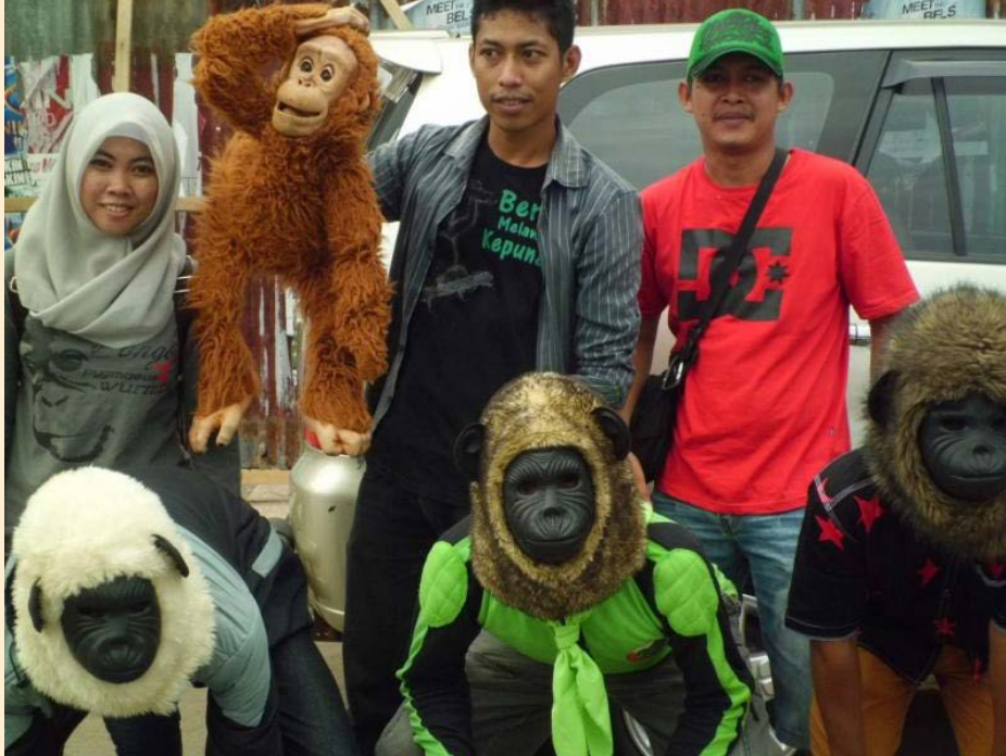
Volunteers in primate masks during the World Orangutan Day parade

We at GPOCP participated by planning three activities for the communities near Gunung Palung National Park, which reached over 500 people combined.