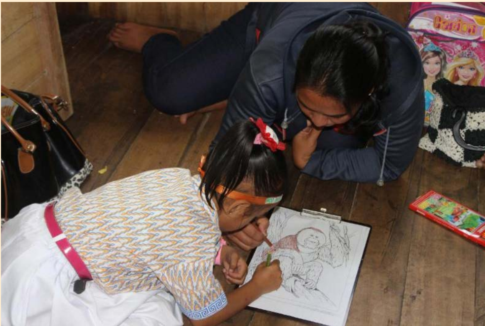
A young girl colors a picture of an orangutan as part of the day's activities.

Our final event took place at GPOCP's Bentangor Environmental Education Center in Pampang Harapan village on August 23rd. We invited 20 kindergarten students and their families from the surrounding community, along with 12 local high school students from six different schools, for a day of conservation-themed art. The day began with a showing of a short orangutan-themed film called "Gunung Palung is My Palace", after which the two groups of students split off. The kindergarteners sprawled out with their crayons and pencils to color pictures that we provided and enjoy time with their families. Meanwhile, the high schoolers, who had each been given time in advance to prepare an orangutan conservation comic book, put the finishing touches on their work. Three judges examined and scored each comic book based on artistic merit, the overall conservation message, and the outcome of a short oral presentation by each student. Choosing a winner proved very difficult as all of the entries were quite good, but after about 15 minutes of deliberation we had a champion! The first, second and third place artists were given trophies and school backpacks, with each entrant receiving a certificate of achievement. The first place comic book, titled "When Will I Be Free?" will also be published and distributed to local school children as part of our Conservation Awareness program.