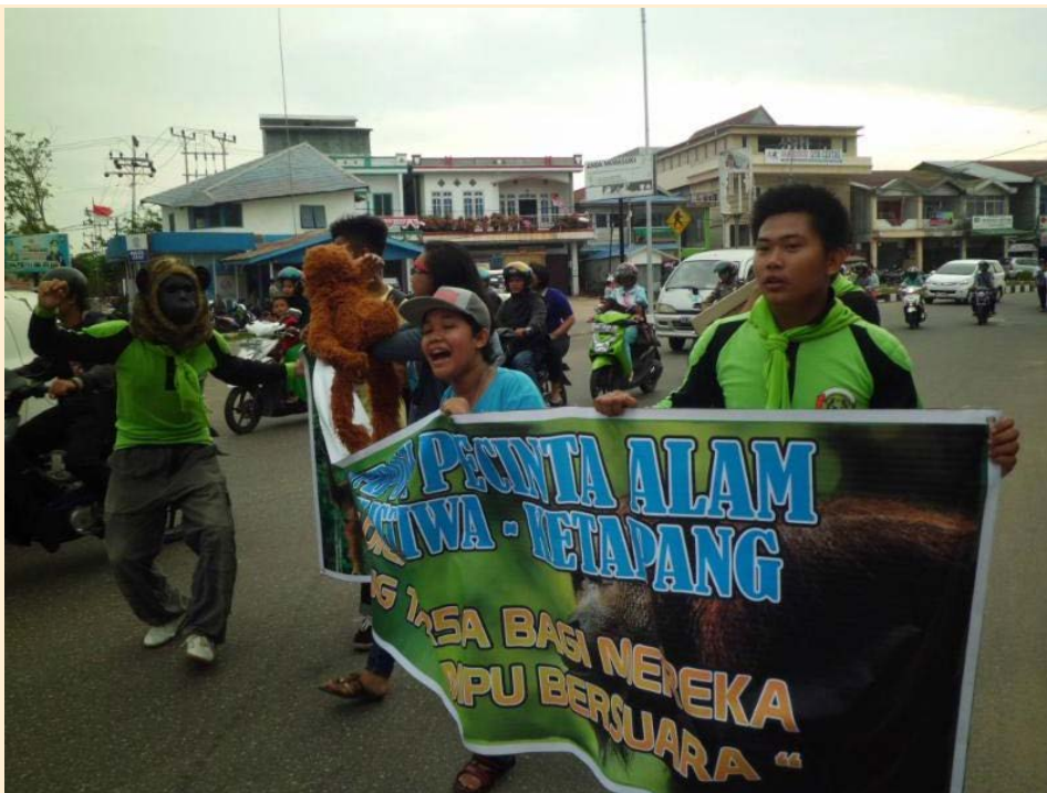
Many volunteers carried posters to raise awareness for orangutan conservation.

Not to be outdone, our Kayong Utara-based volunteer youth group planned a theatrical demonstration in the middle of Sukadana, a small town in the foothills of Gunung Palung. Their performance showed how orangutans are protected under Indonesian law and explained the consequences of poaching or hunting orangutans and other wildlife. About 60 high school students participated in the demonstration, donating their time and energy to the orangutan conservation cause! After the street performance, the students collected more handprints from the local community on a large banner as a visual signal of the community's commitment to protect orangutans. Local residents were enthusiastic about the event, as many were previously unaware of World Orangutan Day and inspired by the youth movement.