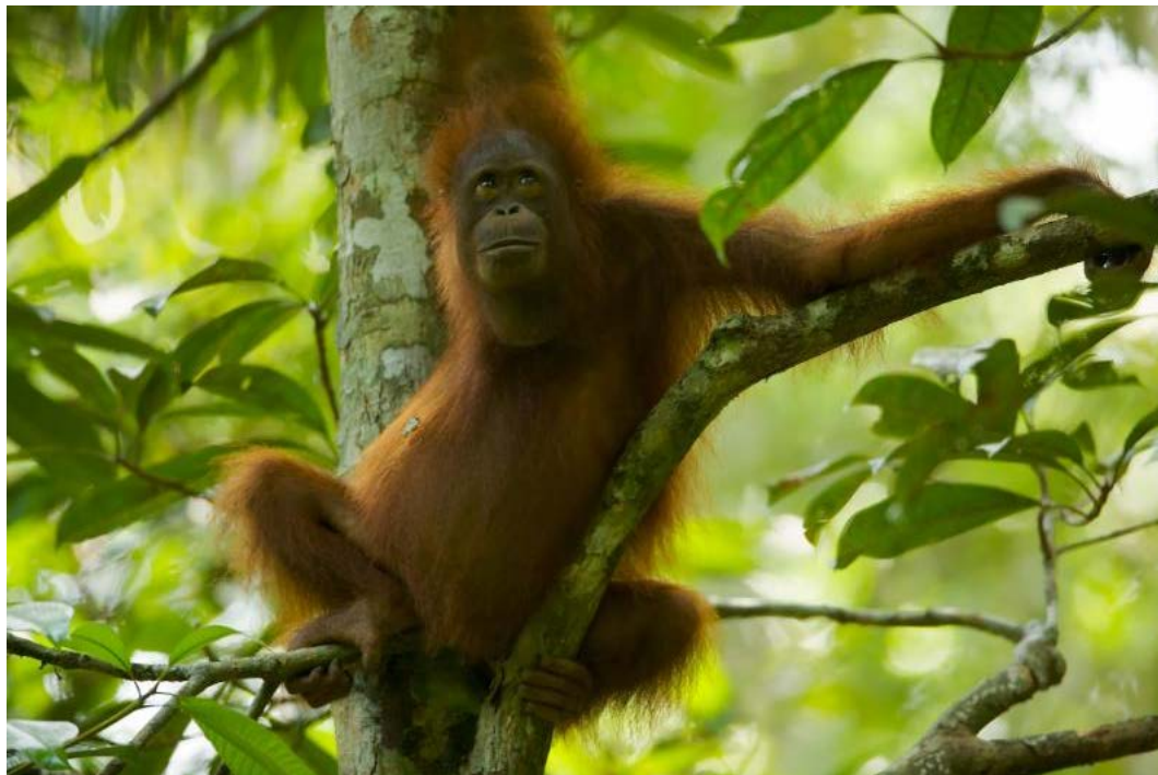
Walimah, one of the female orangutans at Cabang Panti

The field assistants who work for my mom following orangutans have to get up at three in the morning to get to the orangutans before they wake up. The orangutans sleep in nests that they build every night out of leaves and branches up in the trees. Even though I love to follow the orangutans, I'm glad that we don't have to stay out from before dawn till after dusk when they go to sleep. They are really cool animals and it's funny when you see them behave in a way that is so similar to humans, like when they make 'umbrellas' out of clumps of leaves even though they probably keep less than two percent of the rain off.