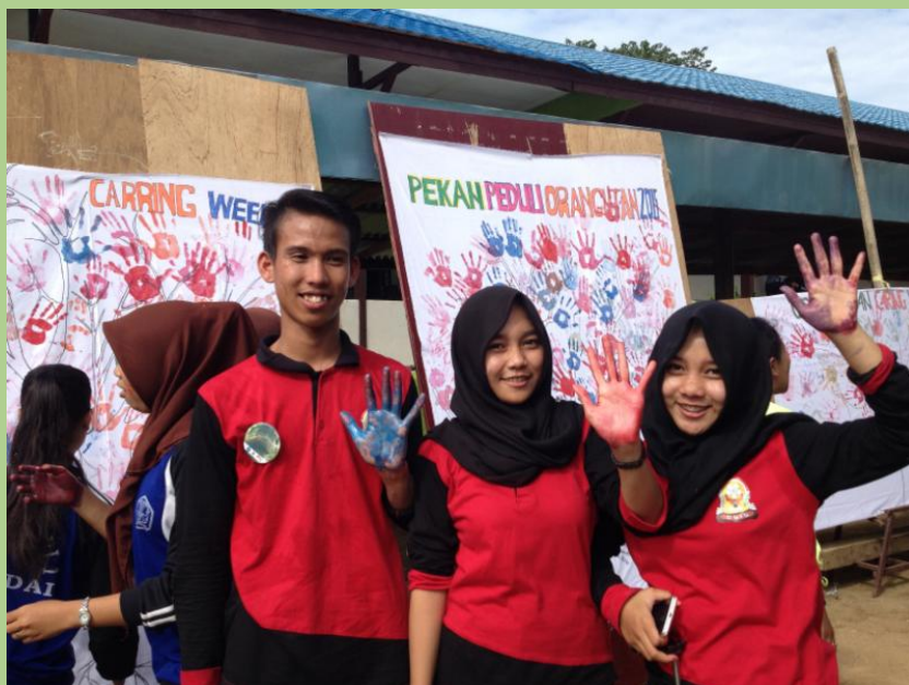
Students proudly show off their hands after adding their prints to our Orangutan Caring Week tree banner.

Throughout the morning, we had several stations set up where participants could create their own conservation campaign messages and get their photos taken. Plenty of selfies were taken as well, and we asked people to post their favorite photos to social media using the hashtag #Sandai4Orangutan. The highlight of the day, however, was our tree painting activity, where we asked all of the participants to declare their commitment to orangutan conservation by adding leaves, symbolized by handprints, onto a tree banner that we had created especially for Orangutan Caring Week. The banner was donated to SMAN 1, where it will become a permanent display.