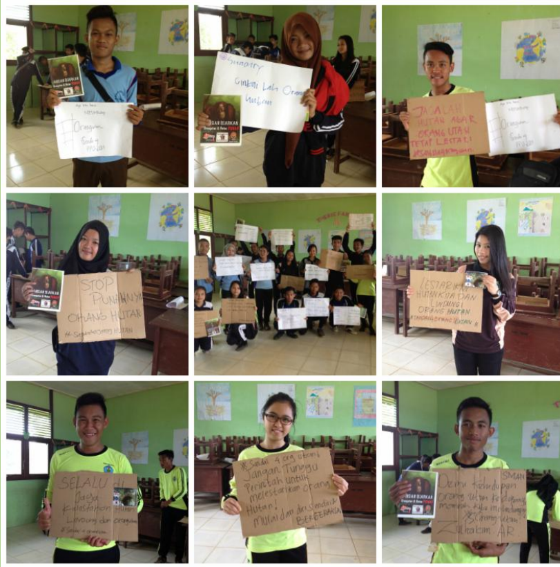
Students from SMAN 1 Sandai share their campaign messages during our #Sandai4Orangutan event.

It's safe to say that this year's Orangutan Caring Week was a success, and we can't wait to do it again next year!