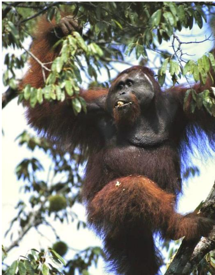
This flanged male probably set a record for the number of durians eaten in one "sitting"!

"A forest durian tree was fruiting and I climbed a nearby tree and made a small platform to wait for any orangutans to come and feed. It was a long wait, and I saw several field assistants who just "happened" to pass by come and check the ground for durians to eat (I had a good laugh because they didn't know I was up in the tree watching them). But finally, the big flanged male came. He saw me in the nearby tree, but didn't care. He stayed three hours and ate 13 whole durians, including the seeds. I got many photos, including this one."