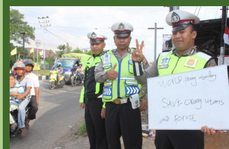
Police officers in Ketapang supporting World Orangutan Day.

On August 19th, we celebrated World Orangutan Day! Our volunteers and interns went a round Ketapang and asked residents, "What do orangutans mean to you?" We had a great show of support from the community. Be sure to check out Facebook and Instagram to see more photos!