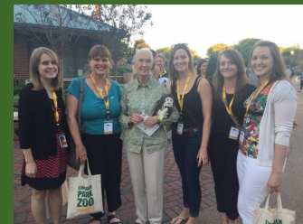
GPOCP team with Jane Goodall at IPS/ASP meeting.