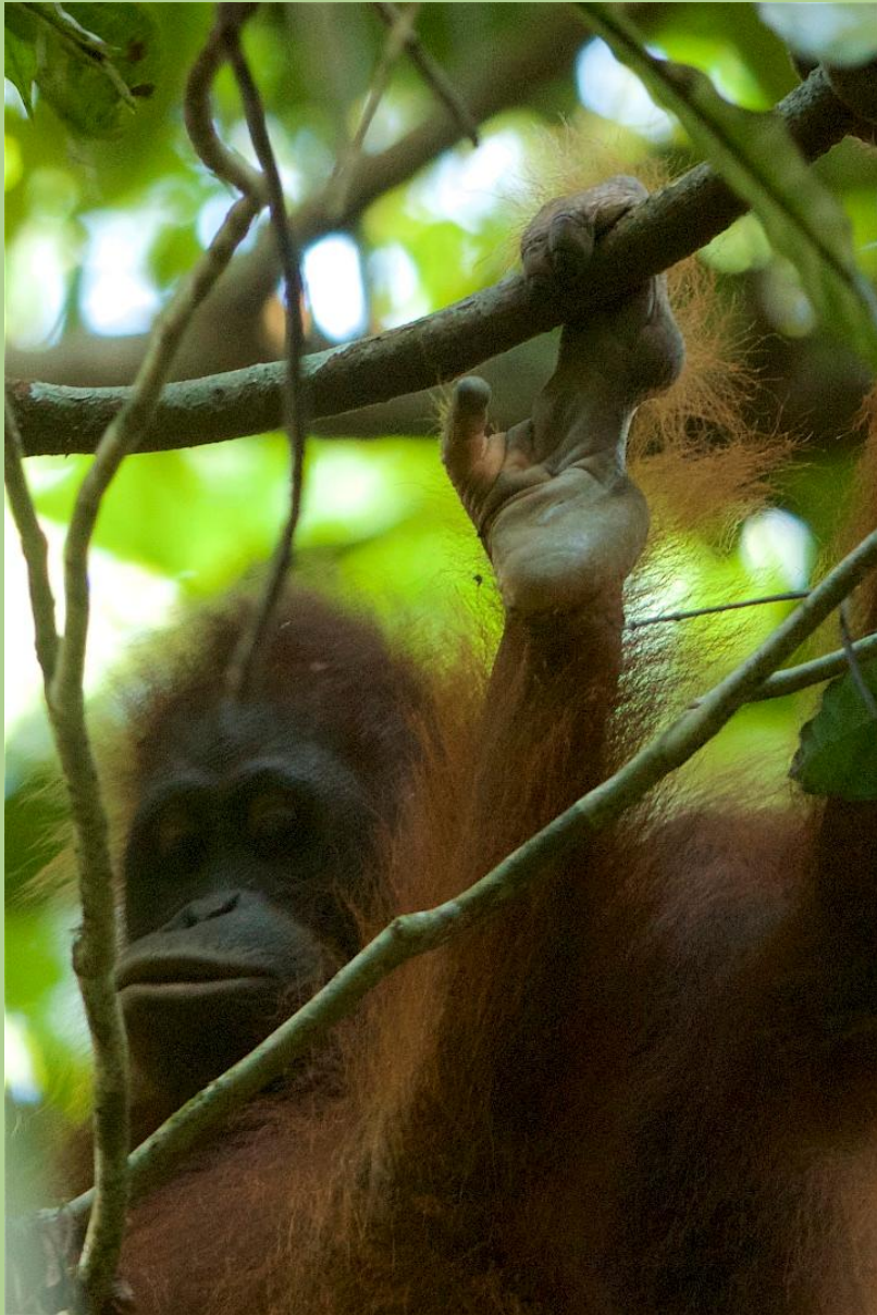
Walimah displays her healed left foot, with two toes missing and a chunk bitten out of the side.

detective work to track them down. Amazingly, Walimah's foot looks totally healed. The skin is no longer puffy and, surprisingly, she is able to use her two remaining toes to help grasp branches. She doesn't seem to be able to use them to form a tight grip, though, but this is a vast improvement over last summer when they were just useless, non-functioning appendages.