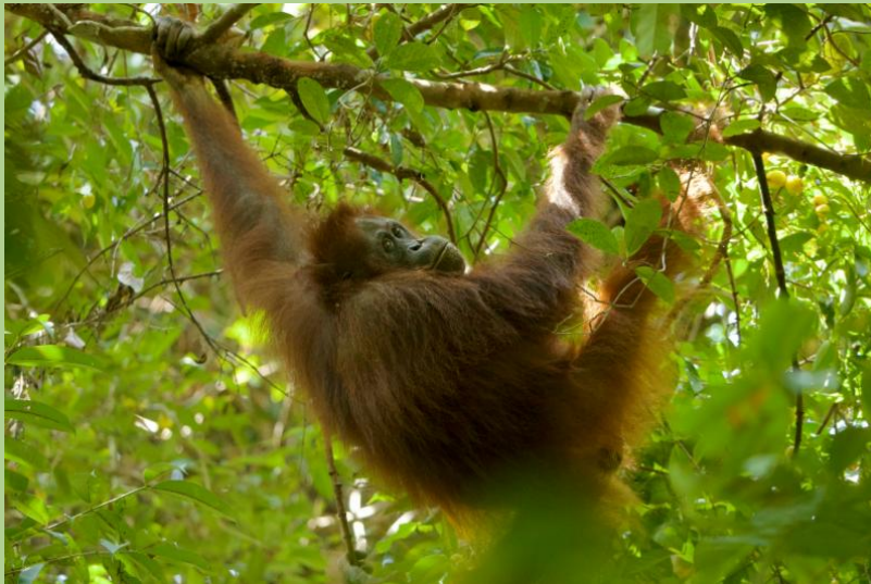
Walimah, moving along to her next rainforest meal.