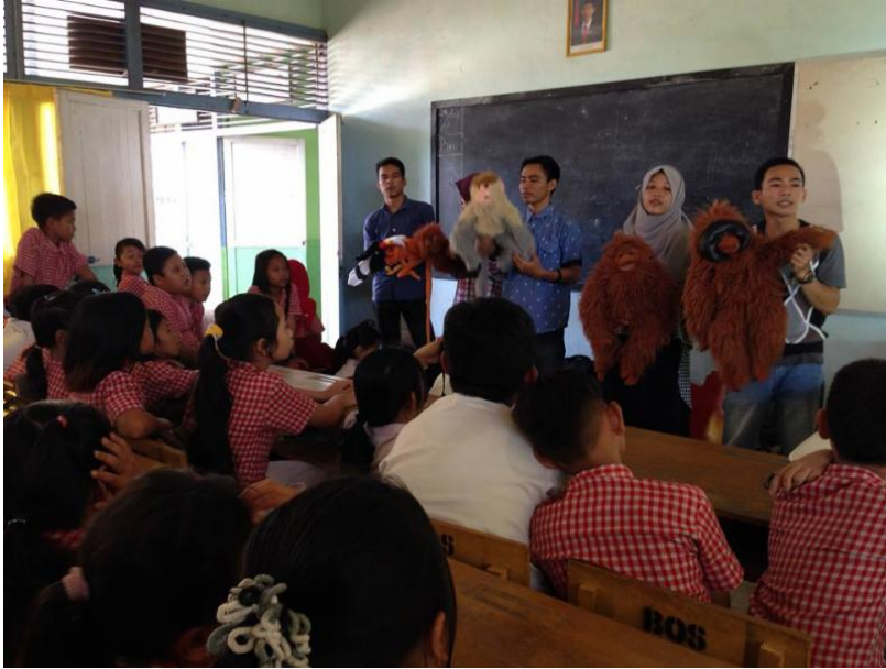
Our BOCS interns educating young students about orangutans and conservation at a local school using puppets and games.