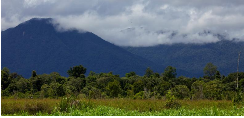
A healthy forest surrounding Gunung Palung National Park.

Gunung Palung Orangutan Conservation Program (GPOCP)