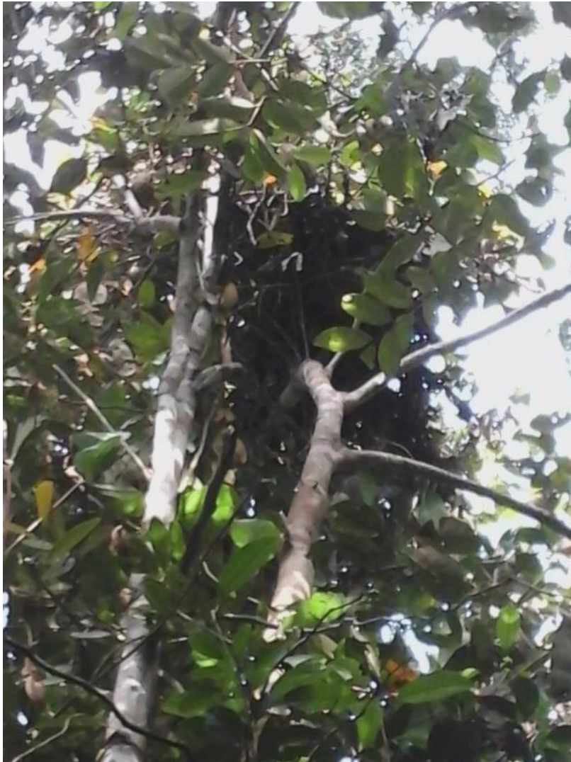
An orangutan nest spotted by our team during their biodiversity survey.

in a sustainable manner. Our initial results conducted in the Paduan Village region found 0.5 orangutan nests per square kilometer for a total of 34 nests from the 6,788 hectares surveyed. We also found more than 100 species of plants, consisting of 42 families. Of those 42 families, we found that 72% are food trees for orangutans. Distribution of the orangutan food trees such as Lithocarpus conocarpus , Lancifolia litsea , Diospyros maingayi , and Santiria oblongifolia ranked high on the Shannon-Wiener biodiversity index, with a value of 3.7. The Shannon Wiener index is commonly used to characterize species diversity within a community. The values range from 0 to 5 and represent increasing biodiversity. A value of 3.7 indicates a rather bio-diverse community and proves that the area is ideal for wildlife, especially orangutans.