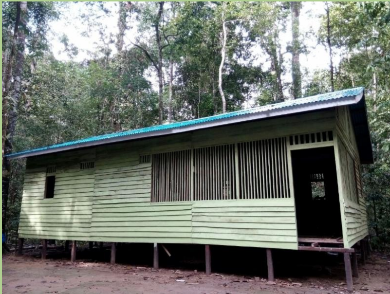
The new camping quarters at Cabang Panti Research Station.

handheld GPS and soon found this to be one of the most valuable tools while in the forest.