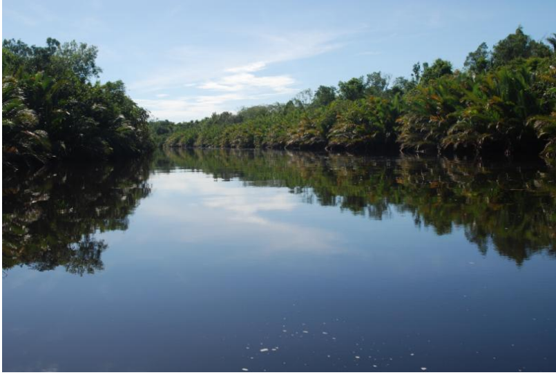
The Matan River, West Kalimantan.

We are currently in the process of creating a new Customary Forest that borders Gunung Palung National Park. This Customary Forest will be a legally protected area of land that is owned by local indigenous communities. These aquatic and terrestrial ecosystems provide many basic life functions for these communities. Probably the most notable is the regulation of the drinking water supply. This healthy forest helps prevent salt water intrusion and filters contaminants out, so the drinking water remains clean. The healthy forest also prevents flooding. The soil is able to absorb excess water, whereas if the soil has been manipulated, less absorption will occur. Less absorption leads to increased erosion, landslides and loss of soil fertility. These are important factors to keep in mind as Indonesia has two seasons: wet and dry. During the wet or rainy season, West Kalimantan usually receives over 400 mm, or 10 inches of rain per month. If this rain is not absorbed into the soil, it runs off the land taking soil, nutrients and debris with it. This runoff, then ends up in the river and can cause catastrophic effects on the aquatic ecosystem. It is important to recognize that changes in terrestrial systems cause changes in aquatic systems.