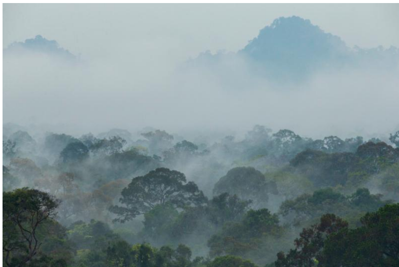
The rainforest of Gunung Palung National Park.

To get the prize-winning still image, I used the time-lapse mode on the GoPro, shooting two frames per second when the orangutan arrived and started climbing up the tree, capturing a series of images as the orangutan climbed. Many of them were blurred, and on some visits, the orangutans climbed around the back of the trunk, out of sight of the camera. But one of the frames, just as the young male Ned passed near the camera, captured the perfect moment of an orangutan in his element.