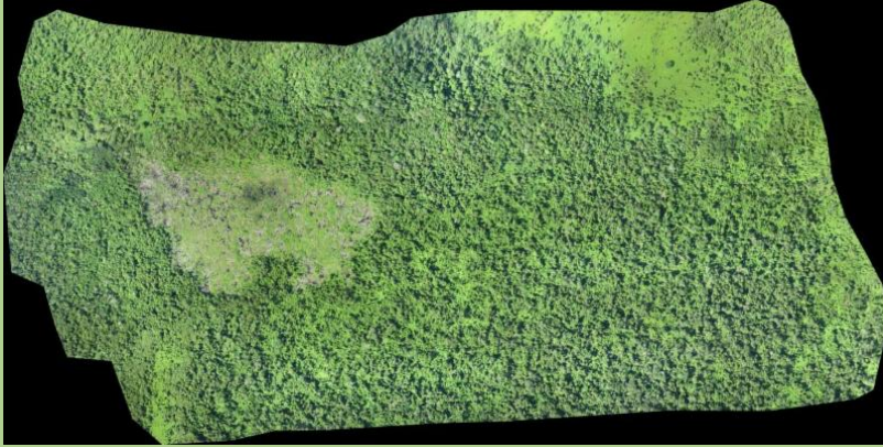
A mosaicked image from one of our drone surveys.

canopy. The camera takes a picture every 3 seconds, so one 50 minute flight will produce nearly 1,000 photos. These images are then stitched together into one image using a special computer program. Our team will then analyze each transect area and record any orangutan nests visible in the imagery. This project will give us an estimate of the current orangutan population in Gunung Palung National Park, and determine if drones are a cost effective tool for such assessments. These data can then be used for more effective conservation strategies and planning.