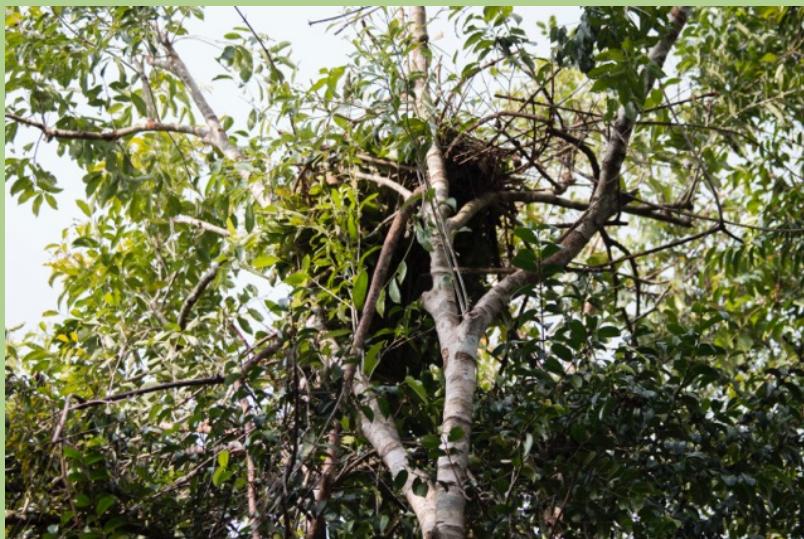
An orangutan nest found during the ground surveys.

The project began about 2 months ago with the ground team trekking into the rainforest to survey and record data on all orangutan nests that were found in the pre-determined transects. Ten transect sites were selected throughout all reaches of the National Park, including peat swamp forest, lowland, and montane forest. These transects were often deep in the rainforest and required up to 15 expedition days to hike in and collect all the necessary information. The ground team is currently finishing up their last few transects and will be making their way out of the rainforest soon. In total, the estimated number of field days for the ground team to complete ten transects is around 45 days.