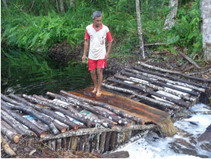
A member of the LPHD of Pulau Kumbang assessing the final construction of the dam.

Gunung Palung Orangutan Conservation Program (GPOCP)