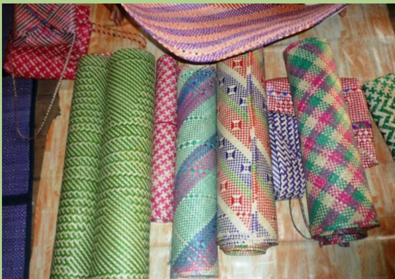
A small sample of some of the crafts the GPOCP artisans make from pandan and nypa leaves.

In 2009, GPOCP established our Sustainable Livelihoods Program, and for the past eight years we have been working closely with communities and local government to help people adopt "forest-friendly" livelihood options, thus reducing their dependence on economic activities that exploit the environment. One of our Sustainable Livelihood programs is supporting our Non-Timber Forest Product (NTFP) artisan groups.