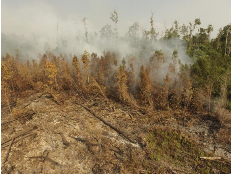
The forest fires of 2015 caused catastrophic damage to West Kalimantan as well as many other parts of Indonesia.

Oftentimes, the cause of these fires is from common land use practices throughout the region. Many farmers use slash and burn methods to clear land and prepare it for the next season's crops. These agricultural areas are rich in peat, which is a major source of carbon. Once this peat land is ignited, it is often very difficult to extinguish, and the fires continue to burn underground. GPOCP found that local people were not aware that these practices are the cause of the fires and the broader impacts these fires have on their land, local forests and the economy. These fires come at a severe cost to the community. Besides the economic loss due to not being able to utilize the land, there is also a great human impact. In 2015 many people, including children, became sick or developed asthma due to the inhalation of smoke. Students were not able to even attend school because the smoke was too thick to travel.