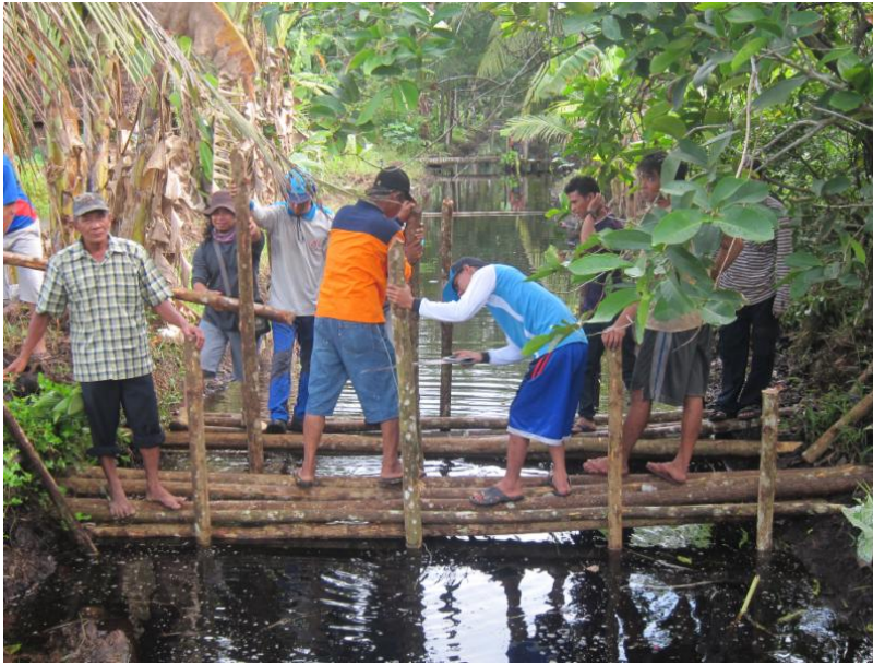
Local villagers and the LPHD of Pemangkat helping construct a dam, which will help conserve water that can be used to fight forest fires in the future.

Management, known locally as LPHD, in several villages. We coordinated community discussions on fire prevention, fire-fighter training and the construction of dams to store water for future use. We assisted groups of all ages by talking to school groups about fire prevention and working with villagers to educate and help construct the dams.