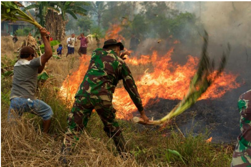
The fires throughout Indonesia in 2015 were often caused by slash and burn farming methods.

Oftentimes, the cause of these fires is from common land use practices throughout the region. Many farmers use slash and burn methods to clear land and prepare it for the next season's crops. These agricultural areas are rich in peat, which is a major source of carbon. Once this peat land is ignited, it is often very difficult to extinguish, and the fires continue to burn underground. GPOCP found that local people were not aware that these practices are the cause of the fires and the broader impacts these fires have on their land, local forests and the economy. These fires come at a severe cost to the community. Besides the economic loss due to not being able to utilize the land, there is also a great human impact. In 2015 many people, including children, became sick or developed asthma due to the inhalation of smoke. Students were not able to even attend school because the smoke was too thick to travel.