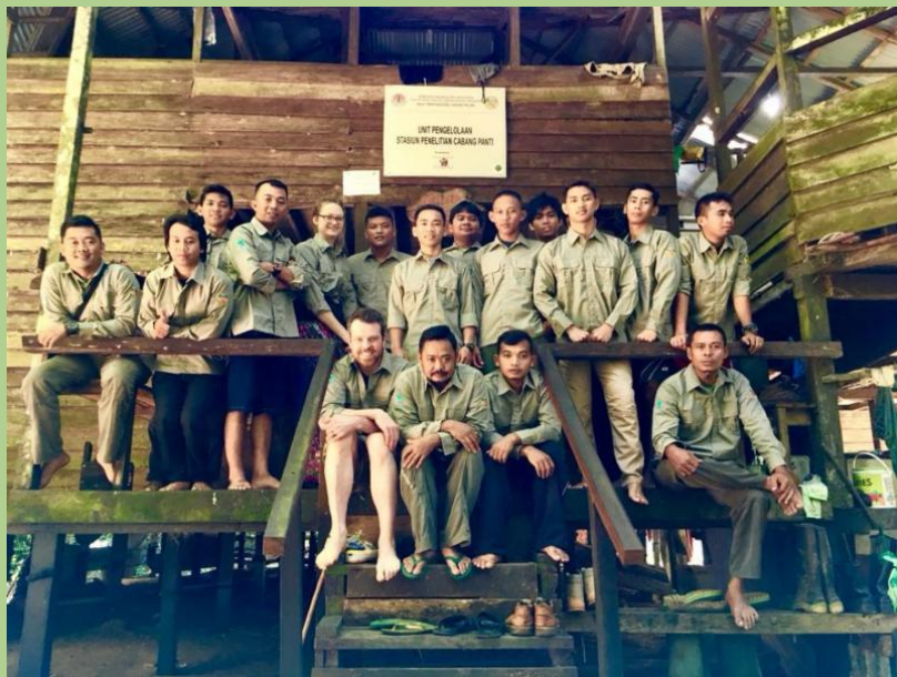
Field Course participants at Cabang Panti Research Station.