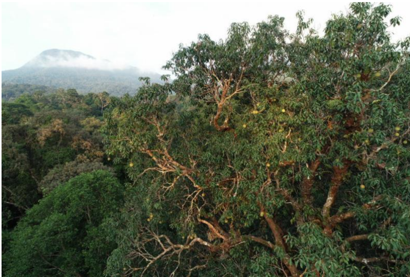
A view into the big mango tree!

Berani, and her seemingly constant companion, the unflanged male Bosman. One of the other favorite spots of the orangutans was a cluster of huge mango trees - two different species - a bit further afield from camp. Most rainforest fruits do not have domesticated varieties - but mangos are one of the exceptions. These huge, tasty fruits provided a feast for the orangutans, many times feeding on them well past dark. Although orangutans are often thought of as solitary, they do spend time together when they can, and it's actually not unusual to see several together in a big fruit tree. They also have their own social drama - as we saw repeatedly when Walimah joined the group. Although intent on following Berani, Bosman also mated with Walimah when she'd come into the mango tree. But, Berani, wanted nothing to do with her, and would flee whenever Walimah approached, giving up her choice spot.