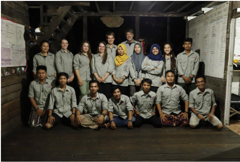
Gunung Palung Orangutan Project Research Team - Summer, 2018.

Gunung Palung Orangutan Conservation Program (GPOCP)