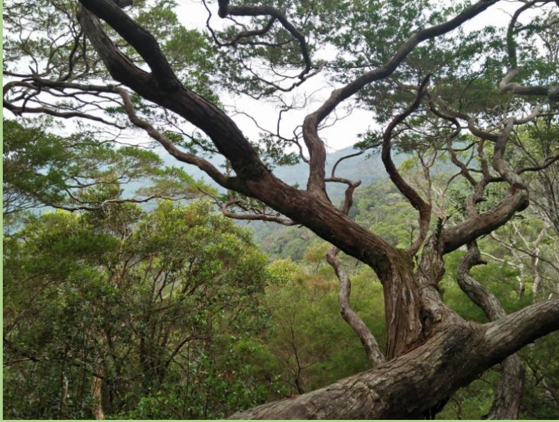
Views near the summit of Mount Gunung.