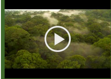
Soundscapes from Gunung Palung National Park

While visiting CPRS, Hendri woke up early to capture the sounds of the rainforest. Sit back, relax, and enjoy this special sound byte!