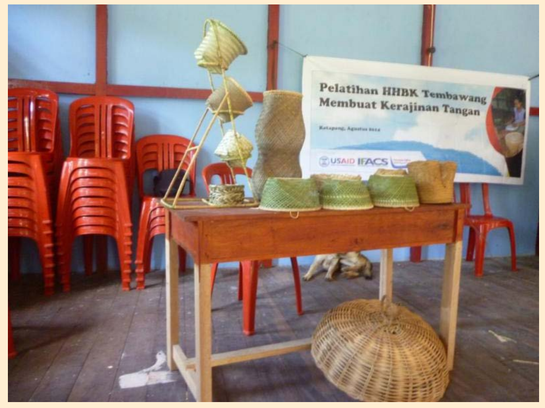
A sampling of the kinds of products these two artisinal craft groups produce

The greatest of GPOCP's strengths is our connection with our community and the way that bond forges new conservation efforts. We partner with many local NGOs to advance our mission to conserve the orangutans of Gunung Palung. One of our Indonesian partners is Friends of the Coastal Communities, known locally as SAMPAN, who, like us, have a Non-Timber Forest Products (NTFP) program that promotes forest conservation through traditional artisanal crafting. This partnership boosts local conservation motivation while also improving local livelihoods and preserving cultural practices in Kalimantan. SAMPAN focuses on mangrove forests, which are a vital life source to the communities living in and around them but are quickly disappearing due to development and pollution. However, these forests still have an abundant supply of Pandanus and Nipa palm, which are a great renewable resource for crafting traditional mats and baskets.