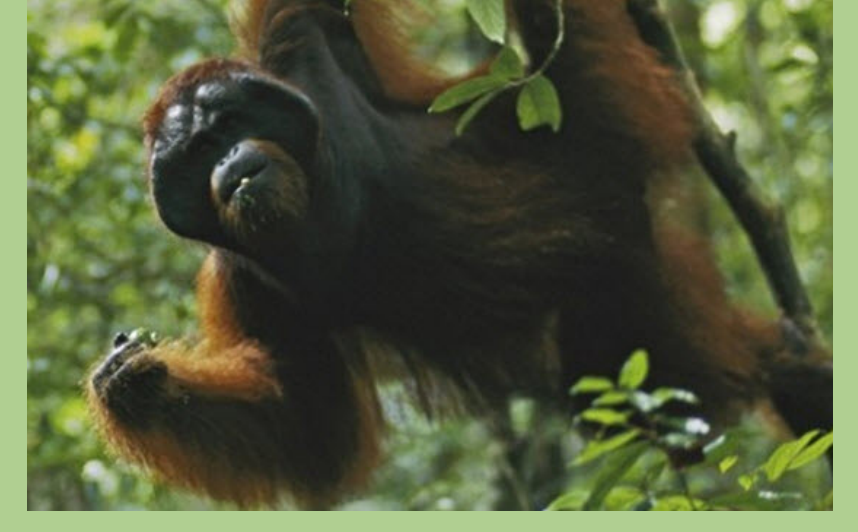
Orangutans play a critically important role in Indonesia's rainforest ecosystems, shaping the habitat of thousands of other species. Photo © Tim Laman.

Now, let's come back to the discussion about what word is best to describe orangutans. The conservation world has already agreed that orangutans are individuals (as opposed to ekor ). One reason for this is that orangutans are solitary, living alone instead of in groups. Another explanation is that orangutans really don't have tails! Bornean orangutans are one of the world's five species of great ape, with the others being Sumatran orangutans, gorillas, chimpanzees, and bonobos. Gibbons, which also don't have tails, are classified as lesser apes. Primates with tails are called monkeys. Those that most of us are familiar with include red langurs, macaques, and proboscis monkeys. For these reasons, the term ekor is misleading, and we at GPOCP always refer to orangutans as individuals.