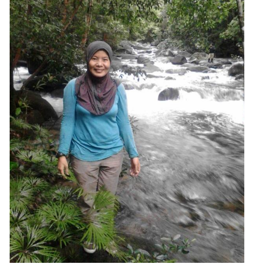
Mayi's first trip to Cabang Panti was a great success! This program will provide excellent capacity building and field experience for our conservation staff.