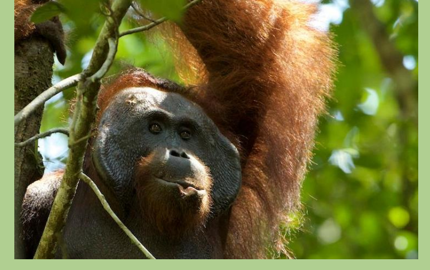
Some people believe that terminology is not important, but in conservation, the words we use often convey our values.

Often I hear people refer to orangutans with the word ekor . For example, they say "We saw one ekor orangutan near the village yesterday." Grammatically this is correct for animals. But, is there a better word to use for orangutans?