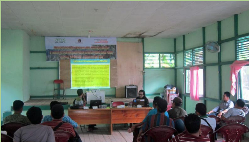
GPOCP Program Manager, Edi Rahman, presents sustainable forest management guidelines at a training session in February.

The Community Forest Initiative, or Hutan Desa , as it is known in Indonesia, is one of GPOCP's core orangutan conservation programs. For the past two years we have been working with over 90 people in five villages to the north of Gunung Palung National Park, helping them through the process of obtaining the legal management rights to approximately 7,500 hectares of peat swamp forest. Our goal is to protect these forests from conversion for outside economic interests, such as oil palm, while simultaneously allowing local communities access to the myriad of benefits that come from living near a healthy rainforest. Through this strategy, we will also conserve thousands of hectares of crucial orangutan habitat in the Gunung Palung landscape. Part of this work is legal in nature, as there is a long bureaucratic process involved in securing a Hutan Desa . Another significant part of the program is capacity building for the Community Forest participants so that when they do receive the forest management rights, they have the knowledge and skills necessary to protect and conserve these lands.