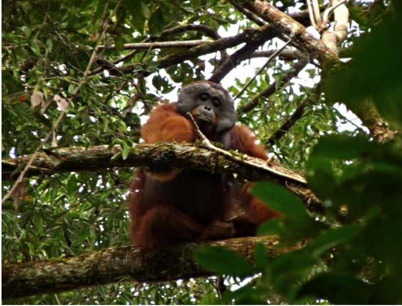
Flanged male orangutan, Prabu, watches over the forest canopy for intruders to his territory.

This near-lack of flanged males lies in stark contrast to our findings last fall. We haven't heard any long calls, and everything is quiet. It feels like there are no flanged males anywhere in the forest. This is very interesting, and is one of the reasons that we are so eager to find out where flanged male orangutans go when they are not in our study site - a question being investigated now by Robert Rodriguez-Suro's project . This lack of males is likely linked to the lack of fruit we have had in Cabang Panti since January. The research site covers eight different forest types: alluvial bench, freshwater peat, peat swamp, kerangas , lowland sandstone, lowland granite, upland granite, and montane. Generally, trees in the different habitat types fruit at different times and the orangutans rotate through the different habitat types in accordance with fruit availability. While the end of 2015 brought an abundance of fruiting trees of many different species, such as the Chaetocarpus that dominated our orangutans' diets in December, since then Cabang Panti has had little to offer orangutans. In contrast, people living in the villages bordering the National Park have reported seeing orangutans closer to their villages, feeding on the wild fruit trees in the outer peat swamp forests.