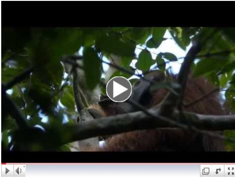
Male orangutan long calling in Gunung Palung National Park (Video © Tim Laman)

period, we found a total of five flanged male orangutans in our study area. Almost every day we could hear long calls, and we even heard them at night when we were getting ready to sleep - usually prompted by tree falls or other loud animal noises. Because our site is actually quite large, extending over 2,100 hectares of relatively pristine rainforest, hearing long calls from our camp is relatively rare and so we felt lucky to be able to hear these every night.