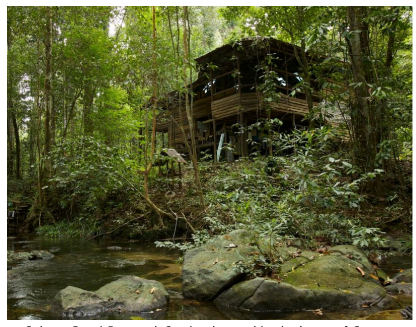
Cabang Panti Research Station located in the heart of Gunung Palung National Park.

Cabang Panti Research Station is often thought of as this mystical place. The research station is not open to tourists, so even though many people have heard of it, few have actually been to Cabang Panti. So this month we decided to bring the research station to the villages! We wanted to let the local communities know about the research that is being conducted and how it is being used to make conservation decisions for orangutans and their We focused on three of the villages surrounding Gunung Palung National Park with which we interact the most - Tanjung Gunung, Sedahan Jaya, and Teluk Melano. We gave presentations about the research activities, showed short films about orangutans, and held question and answer sessions to clarify any confusion about what actually occurs at Cabang Panti Research Station (CPRS).