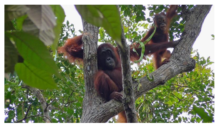
Critically endangered orangutans of Gunung Palung National Park.

familiar with our activities, but they did not understand why we do behavioral follows and data collection on wild orangutans. To address these issues, we held these community discussions in the three villages that we primarily work with. It was also a great opportunity to spread awareness and knowledge about orangutans and their current plight on the IUCN Critically Endangered List.