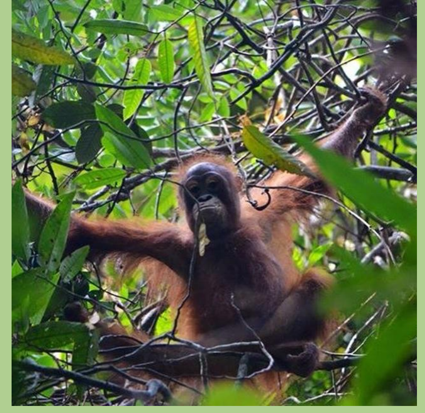
A young orangutan trying to be elusive in the tree tops of Gunung Palung National Park.

Beth Barrow followed Brodie to present about the KKL Project. We are often asked what is KKL, it stands for Kelasi and Kelempiau, which is the Red Leaf Monkey and the Bornean Agile Gibbon in Bahasa Indonesia. This project focuses on ecological systems including distribution and populations of both plants and animals. The KKL Project also records temperature and rainfall at 12 weather stations positioned strategically over the two ridges of Mount Palung and Mount Panti. It is very interesting to see the differences in rainfall and other variables between each station considering their relative close proximity! Beth explained their five different methods used in the field (phenology, camera traps, census routes, behavioral follows and weather stations), all aimed at collecting data on factors limiting vertebrate population dynamics in GPNP. One of the most interesting aspects of the KKL Project, and their most recent addition as of 2015, is their camera trap program. She included some interesting footage of elusive species that had never been recorded at Cabang Panti before. Beth then went on to outline some results from their research into gibbon and leaf monkey population dynamics and the factors limiting them. Specifically, those habitats over 800 meters in elevation are of extremely low quality for these two primate species. Populations there would likely cease to exist if it weren't for immigration