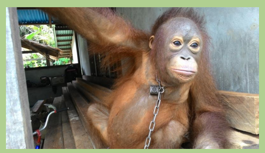
An orangutan kept illegally as a pet and rescued because of investigation work by GPOCP.

seeing such magnificent wildlife locked up in cages.