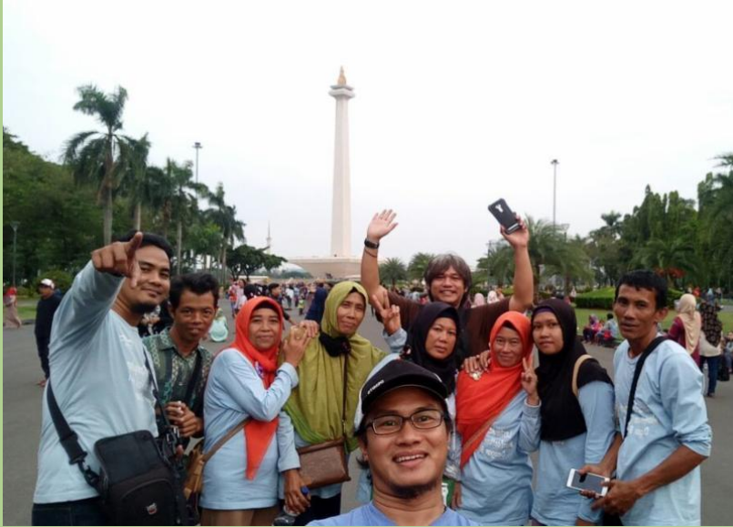
GPOCP staff and artisans visiting the National Monument, Monas, in Jakarta.

Overall this trip to the PARARA Festival was a huge success. Our artisans promoted and sold their handicrafts, received national attention for their sustainable work, and were able to make lasting memories. GPOCP is enthusiastic about this prosperous event and hopes this will motivate and inspire new artisans to work with GPOCP and make sustainable products, helping to create a sustainable livelihood movement in Indonesia!