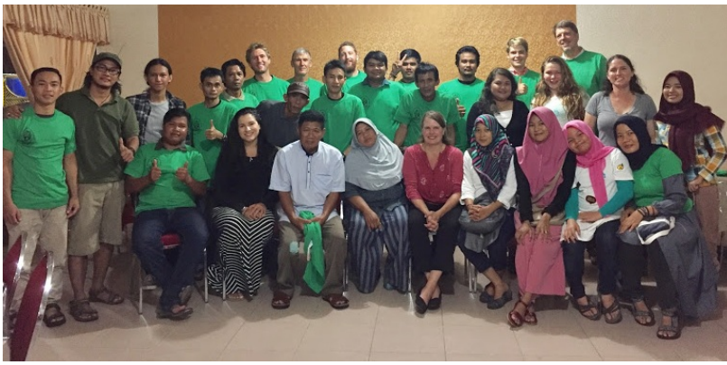
GPOCP Conservation Staff (and friends) July 2017.