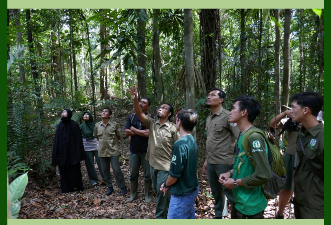
The group looking at the feeding trees within the 'Forest School' for orangutan rehabilitation.

Ella spoke about the behavior of wild orangutans in Cabang Panti and I shared my knowledge on how to identify orangutan feeding plants, what parts they ate and how to determine mature, immature and ripe fruits. Some of the other interesting presentations from Jejak Pulang included talking about the development of feeding competence in orangutan rehabilitation and determining food availability in the orangutan forest schools.