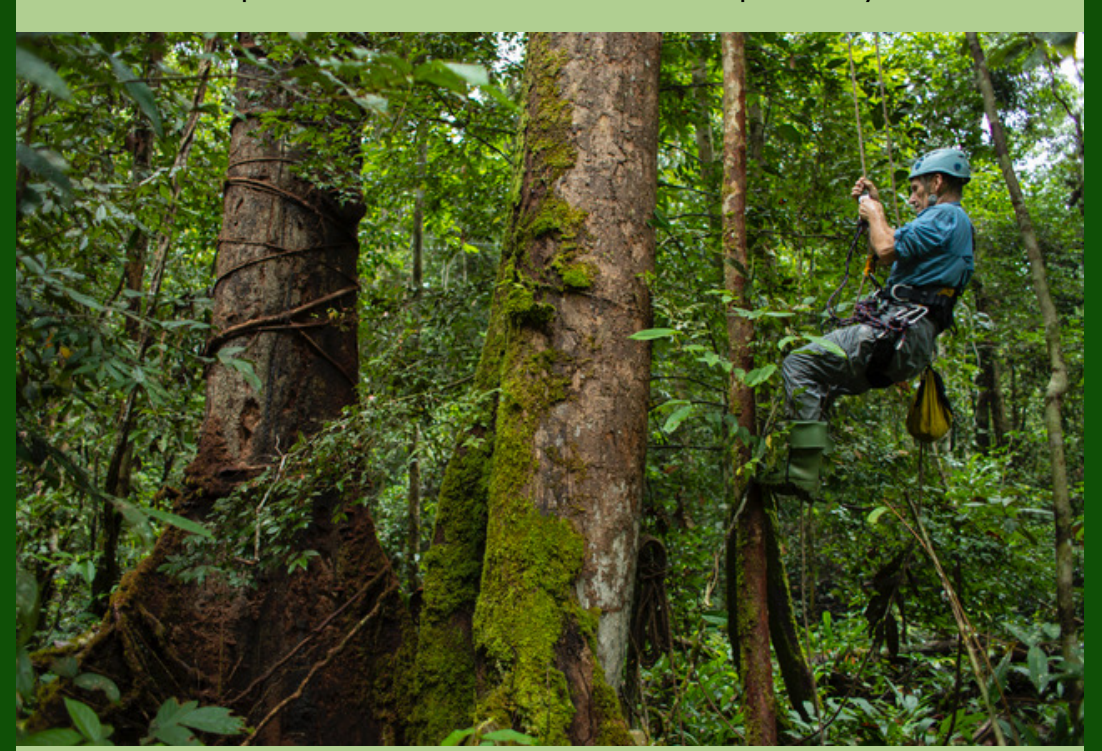
Tim Fogg climbing the tall trees of Gunung Palung National Park to rig remote cameras for the BBC's Seven Worlds One Planet program.

First, we shared some background about the project and reflected on the accomplishments we've made over the past 28 years.