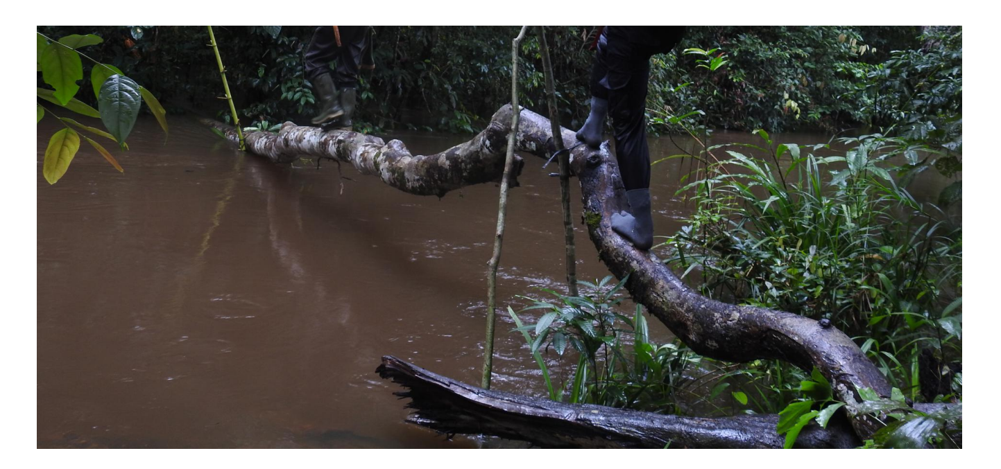
The dedicated survey team hikes through flooded trails to reach the survey transects.

The two sites where we conducted the surveys were secondary forests that were previously logged. To gather information, our colleagues from BTNGP routinely carry out illegal logging patrols in this area. In general, it is very rare to find orangutan nests in these locations. During our survey we most commonly found plants with an average diameter of 20 cm, but very rarely found large trees. Of the 13 locations we surveyed, Matan had the fewest number of nests. The nests we did find were mainly class C and D, which means they were old nests built a long time ago. Because of this, we suspect that the orangutan population here is very small. Orangutans might have moved to other places that are safer, with less human disturbance such as poaching and illegal logging. Also, the habitat here is unfavorable for orangutans, since there are few large, fruiting trees where orangutans can eat, travel and rest.