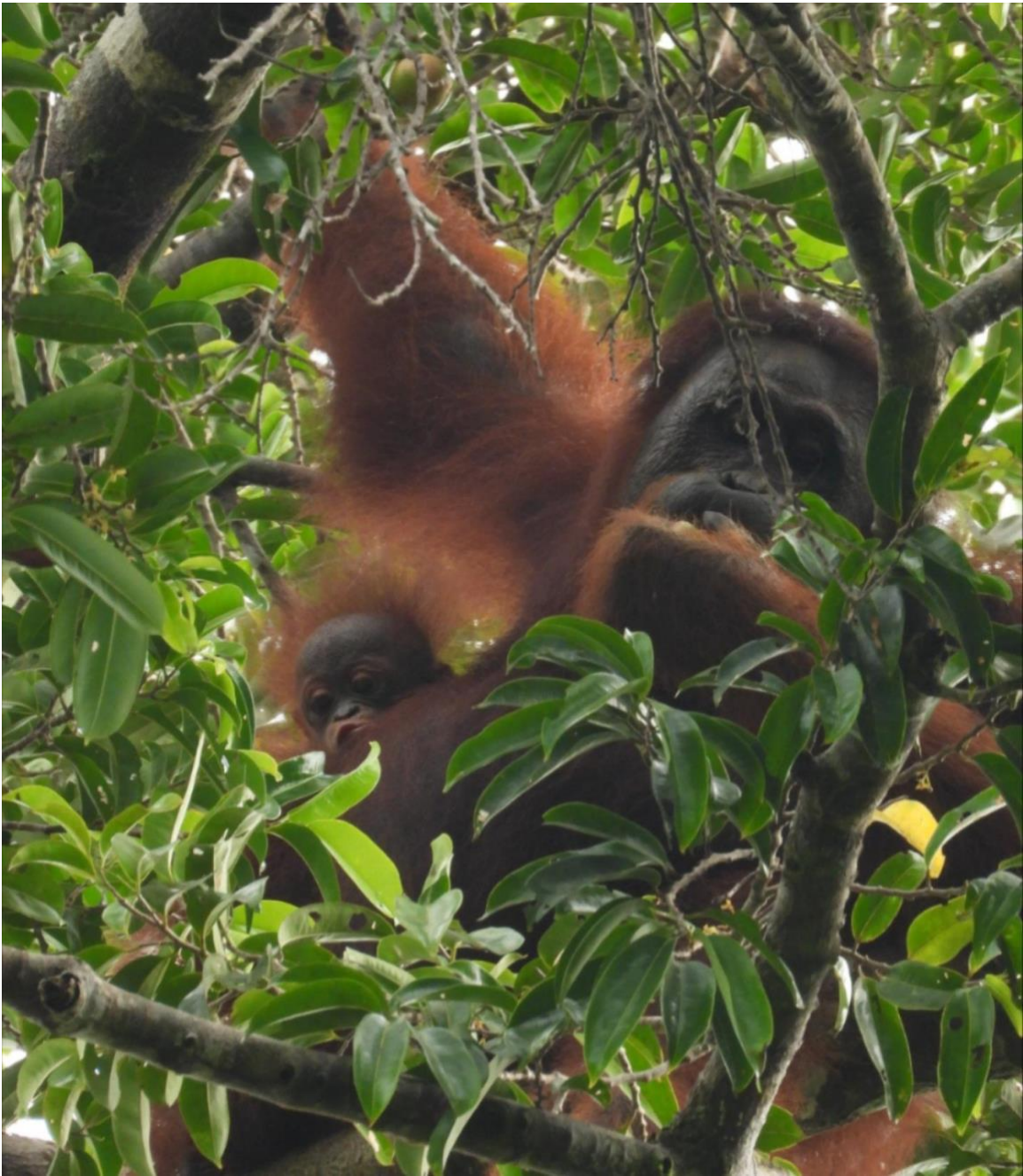
The mother-infant pair that joined Alfred for a party.