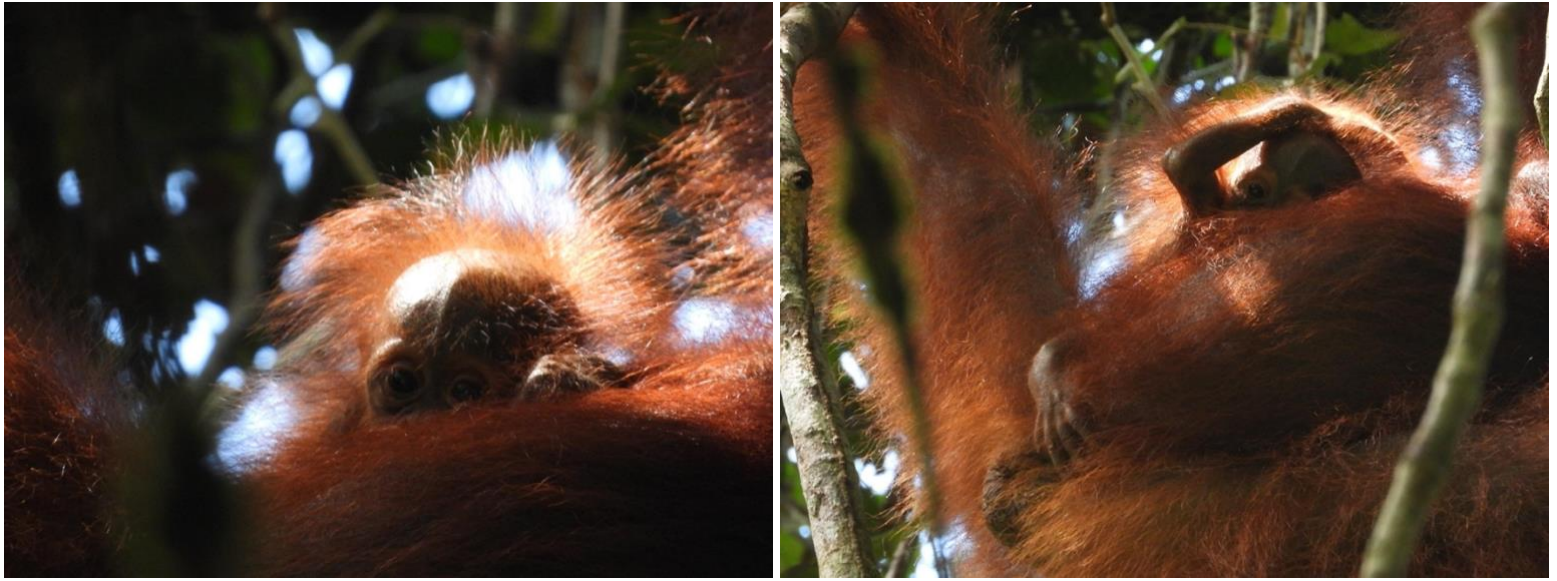
Researchers catch brief glimpses of the baby's face.

difficulties because the weather has been quite good and the mother orangutan has been moving slowly while the baby clings to her body. It has still been quite difficult to get good photos and videos of the baby, because it is always hiding within the mother's fur. It almost seems like the mother doesn't want her baby to be on camera!