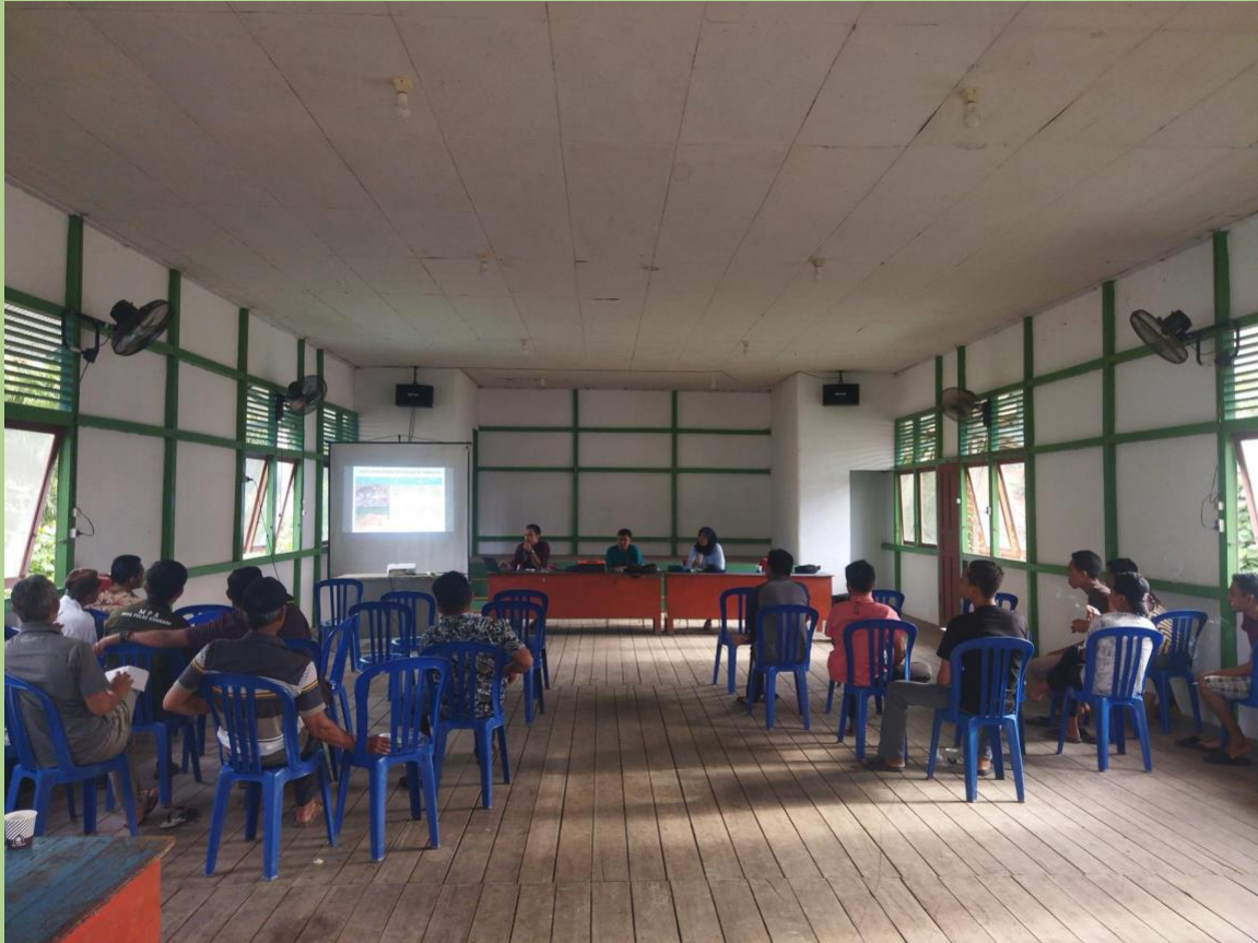
Community members participate in a group discussion.

The community also discussed the territorial boundaries between the protected forest area and the village forest area, which previously had no clear boundaries. Community members provided their input and decided that in order to best protect animals and the environment, they would install informational signs about protected animals along this boundary.