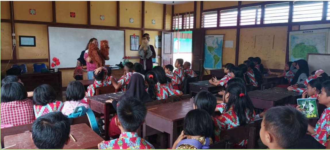
Staff perform a puppet show for a classroom of schoolchildren.