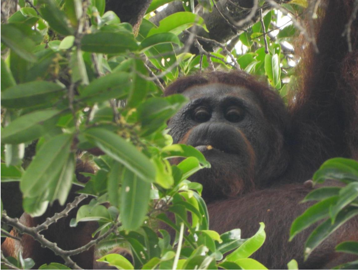
An adult female orangutan begins eating in the same tree as Alfred.

After arriving, they waited for the orangutan to wake up. Alfred woke up at 5:34, then urinated and defecated. Soon after, he travelled to a Ficus sondaicus tree to begin eating its fruit. Suddenly, at 5:55, a female orangutan arrived at the same feeding tree and also began eating the fruits. This is what we call a 'party' – when two or more orangutans are within 50 meters or fewer of each other.