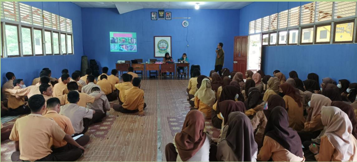
Older students listen to a lecture.

The teachers informed me that all of the students and teachers really appreciated the environmental education program we implemented. They also asked Yayasan Palung/GPOCP to provide additional modules/lessons that could be used in classrooms, especially to supplement learning materials on topics related to environmental science.