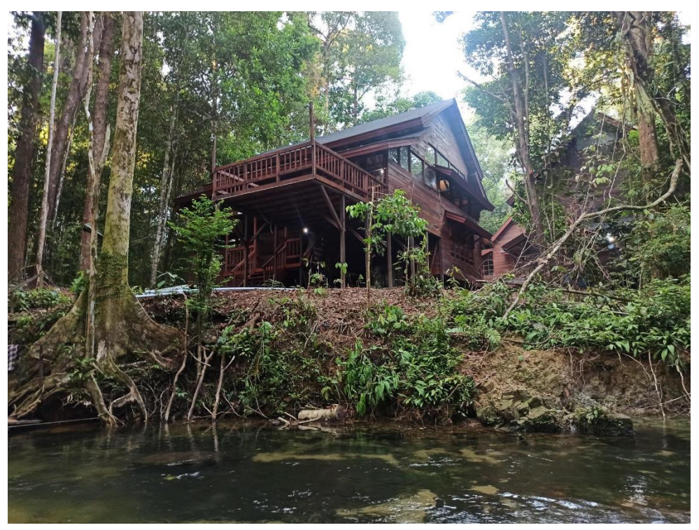
The view of Cabang Panti Research Station from the Air Putih River.

On the second day, I started my first activity of observing tree phenology. Phenology is the study of cycles of biological life cycles, in this instance, the flowering and fruiting of various tree species. I learned a lot to understand the stages and phases of plants, namely the fruiting, flowering and young leaf phases. These phenological observations can be used as a reference for the availability of orangutan foods in specific observation plots, and also help other field assistants who are looking for new orangutans to follow.