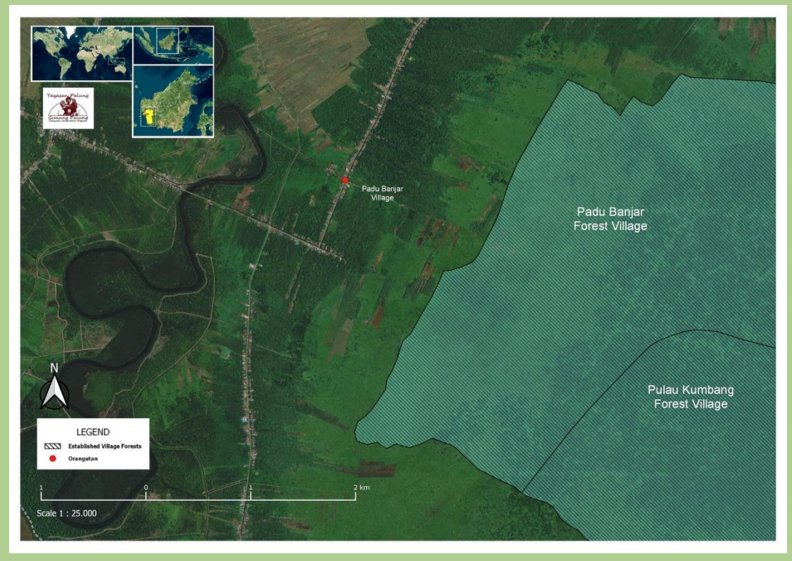
A map of the Padu Banjar region, displaying the distance between the village (and community gardens) and the Village Forest. The red dot indicates where the orangutan was first found.

When interactions like this occur between orangutans and humans, the LPHD plays an active role in conducting monitoring to dispel or block orangutans from entering community plantations. Even though our LPHD is small, we are always able to carry out monitoring. The aim is to prevent orangutans from entering and destroying community gardens, while also avoiding any negative impacts on the orangutans themselves.