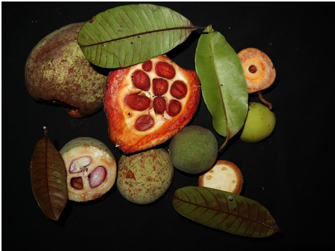
Top: Fruits from the family Dipterocarpaceae. These trees are plentiful in Gunung Palung and fruit at irregular intervals.