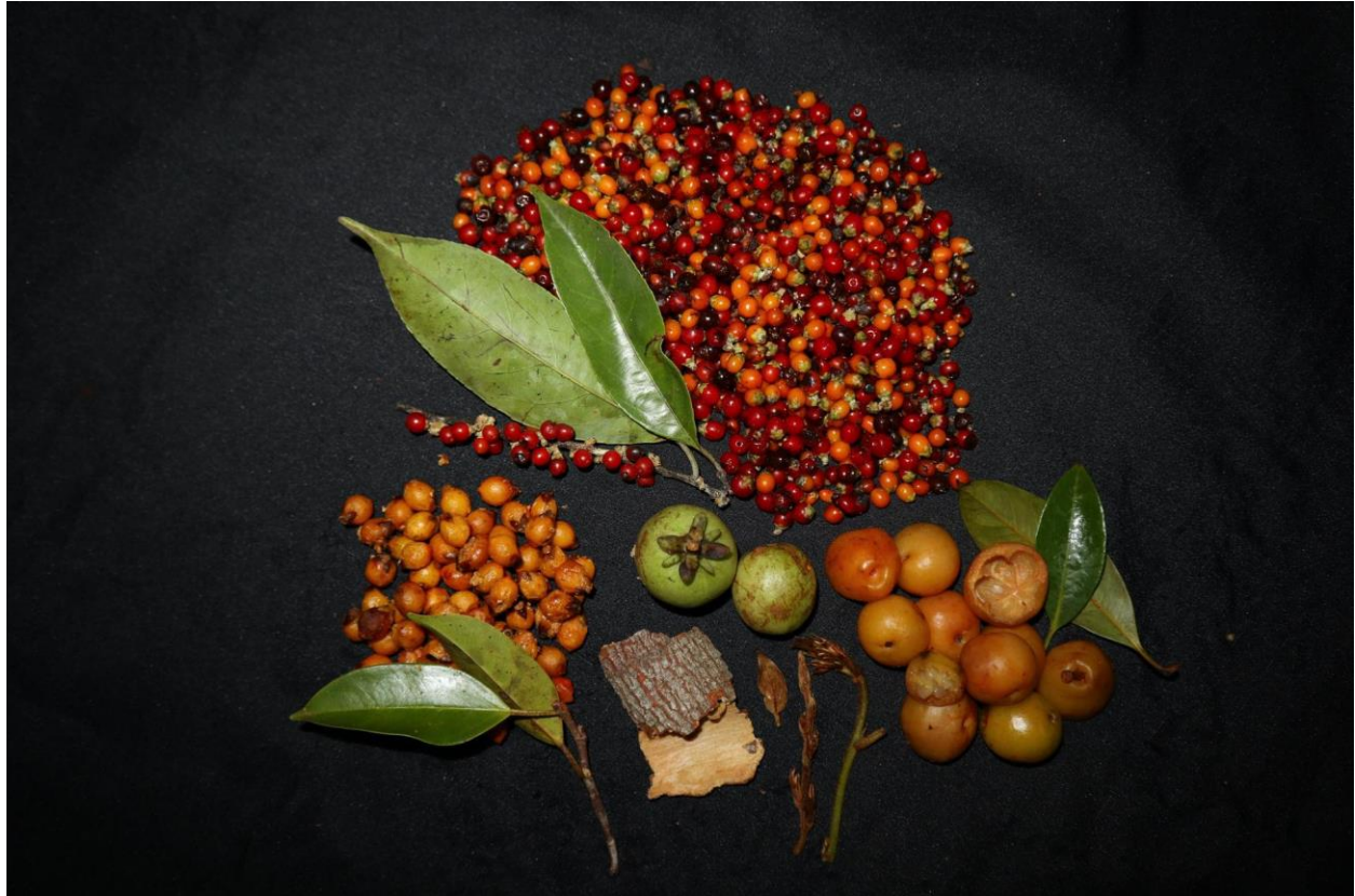
Ficus and Garcinia fruits.

In 2021, I combined my job with a new hobby, which was to make collages of all the orangutan foods eaten each month. Each day we collect samples of the fruits or plants eaten by the orangutans. To the extent possible, I get complete samples of the food eaten, often with the help of field assistants that are following the orangutans. I then set aside one-by-one, good examples of each of the various types of plants that the orangutans fed on during the day. Then I photograph them and combine the photos into folders, with each folder containing the name of a different genus and species. I do this every month and I make a list of what plants orangutans ate that month. I then arrange the food samples artistically into one frame and photograph the samples together. I do this to be able to distinguish easily what is always present in the forest and what orangutans only eat occasionally. These photographs thus become a visual representation of the range of foods orangutans eat each month as well as being visually pleasing!