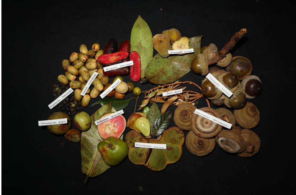
An assortment of orangutan foods labeled with their genus and species names.

unique and interesting things in this forest – very adorable orangutans, their interesting behavior, and that they eat both plants and small insects. Moreover, when I entered the forest I found animals, large trees, lianas hanging freely, leaf litter on the forest floor, and each different habitat gave off a calming atmosphere. All of these became objects of my interest to study and capture with a camera.