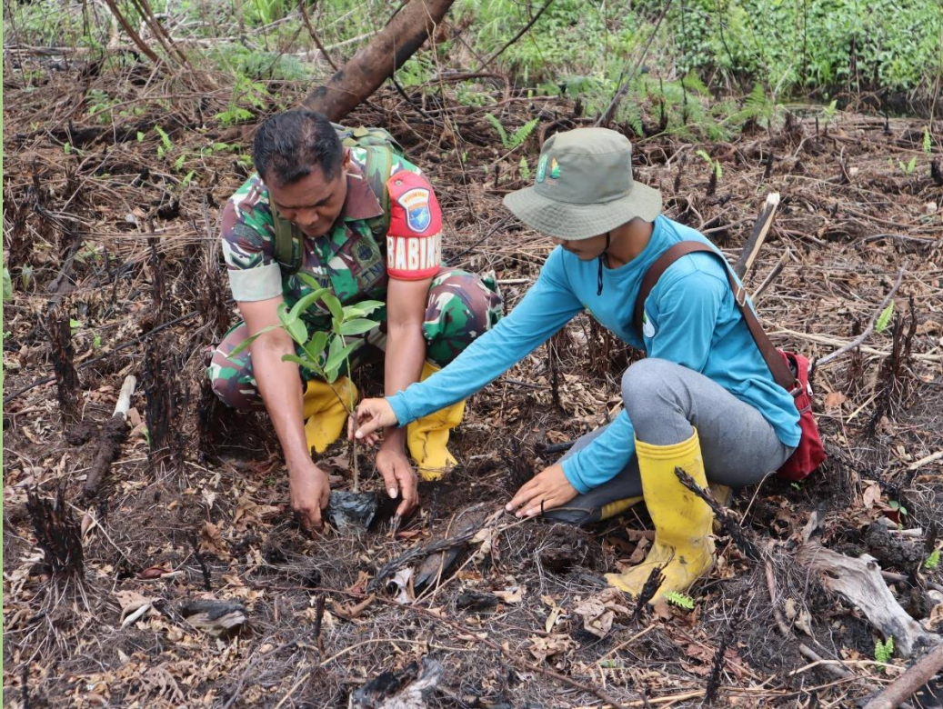
Kicking off Orangutan Caring Week activities with tree planting in Pulau Kumbang (top) and in the burned areas of Padu Banjar (bottom)