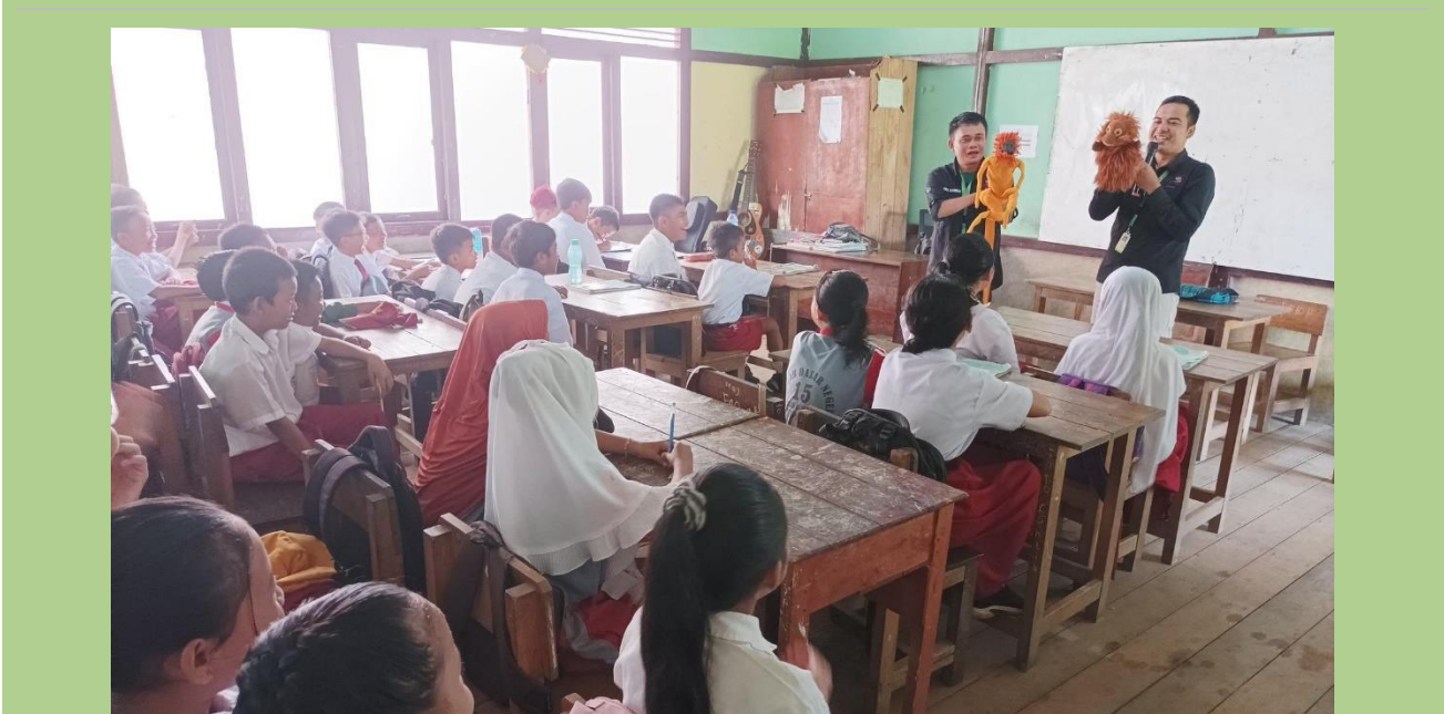
Training on orangutan nest and food identification in Pemangkat (top) and giving a puppet show in Pulau Kumbang Village (botton)

Meanwhile, planting in Padu Banjar Village was carried out in the Village Forest area that was burned just a couple of months ago and is included in the utilization zone. Planting activities in the Padu Banjar Village Forest area were attended by Yayasan Palung, the Padu Banjar Village Forest Management Board