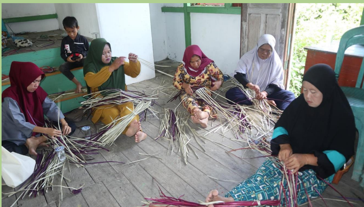
Pandan mat weaving competition.

Our Environmental Education Program (PL) conducted a number of school activities, including a puppet show and lectures at Pulau Kumbang Elementary School. Meanwhile, our Village Forest (HD) team continued to identify animals using thermal drones in the Pemangkat Village Forest area. Animal identification activities using thermal drones were carried out at night both in the Padu Banjar village forest and Pemangkat village forest, so that the warm-bodied animals can be detected against a cooled background.