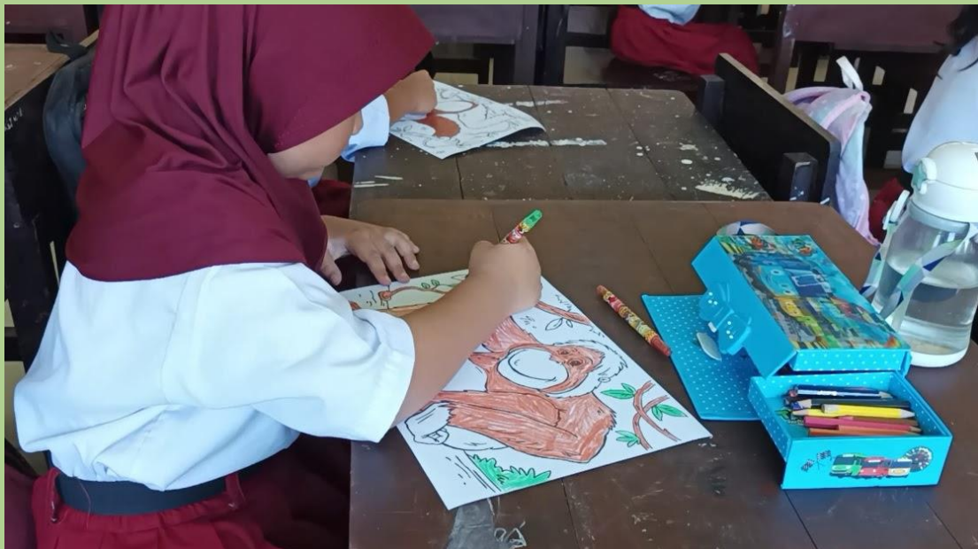
A training on land-clearing without burning (top) and a coloring activity with school children (bottom).