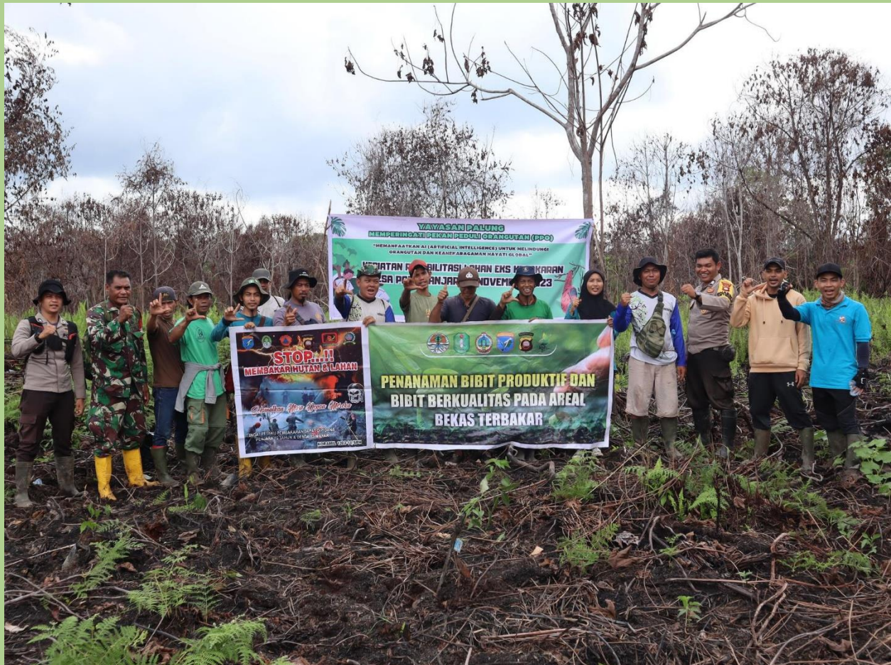
Group photo for Orangutan Caring Week's planting activities in Padu Banjar where we rehabilitated land that burned in September.

The many activities that Yayasan Palung carried out from November 12-15, 2023 to celebrate Orangutan Caring Week were intended to invite all parties to be more concerned about saving orangutans and their habitats which are increasingly threatened due to various human activities such as hunting, land clearing (settlements, plantations, mining), illegal logging and forest and land fires. We shared many of these activities on social media, and encourage you all to follow us there!