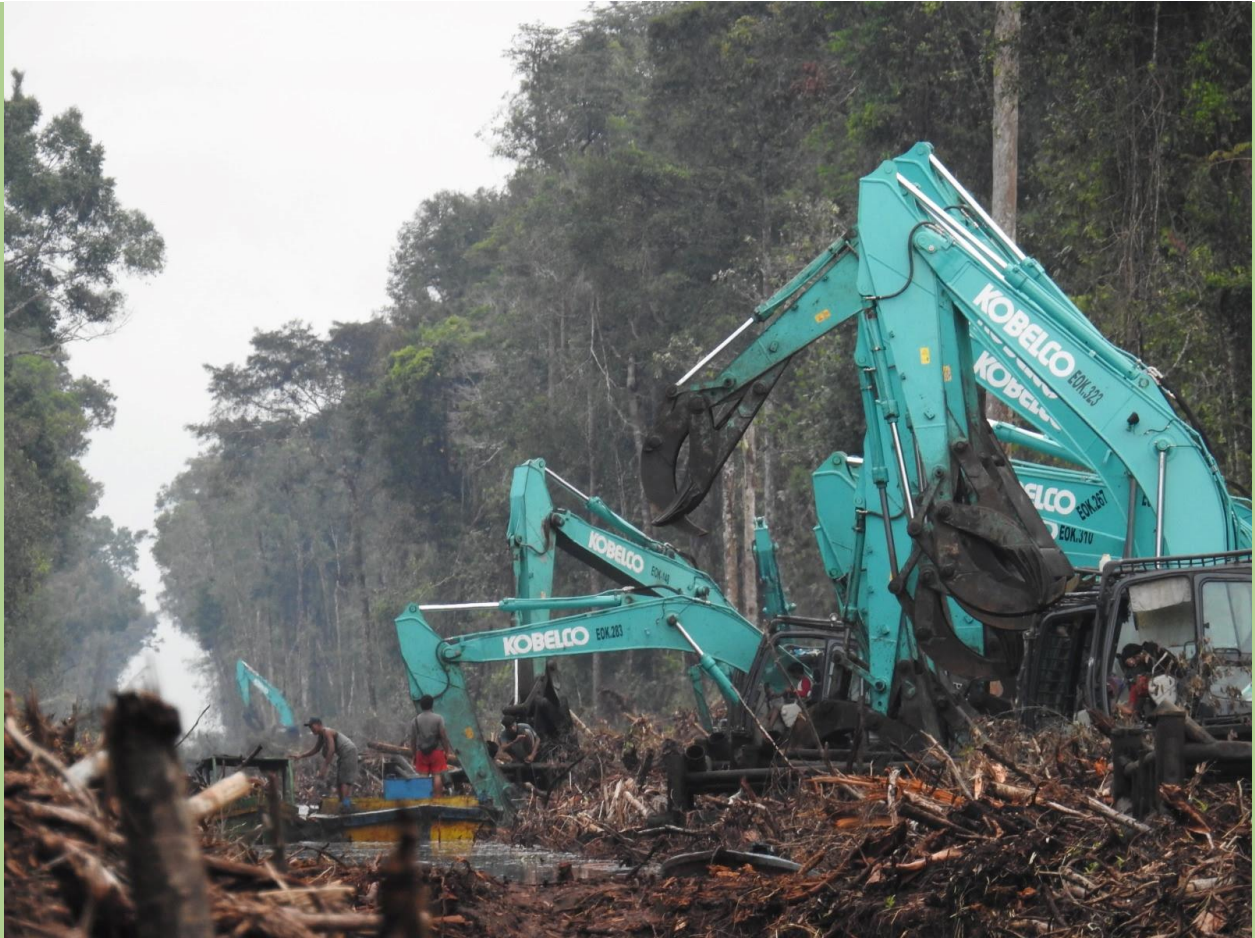
Active forest clearing just outside the village forest area.

At the end of 2023 and in early 2024, there was a sharp spotlight put on PT. Mayawana Persada by conservation activists, both individuals and institutions and national and international media (see one such news article here ), leading the company to cease land clearing activities, especially in peat swamp forest areas which are designated as protected animal habitats. This encouraging result was followed up by the issuance of a Letter from the Directorate General of Sustainable Forest Management of the Ministry of Environment and Forestry on March 28, 2024 addressed to the President Director of PBPH-HT PT Mayawana Persada in Jakarta/Pontianak Regarding the Termination of Logged Over Area (LOA) Logging Activities. In the letter it is stated that in consideration of achieving Indonesia's FOLU Net Sink 2030 target, PT Mayawana Persada must stop all logging activities in the logged over area (LOA) and focus on activities such as land rehabilitation and other environmental restoration activities.