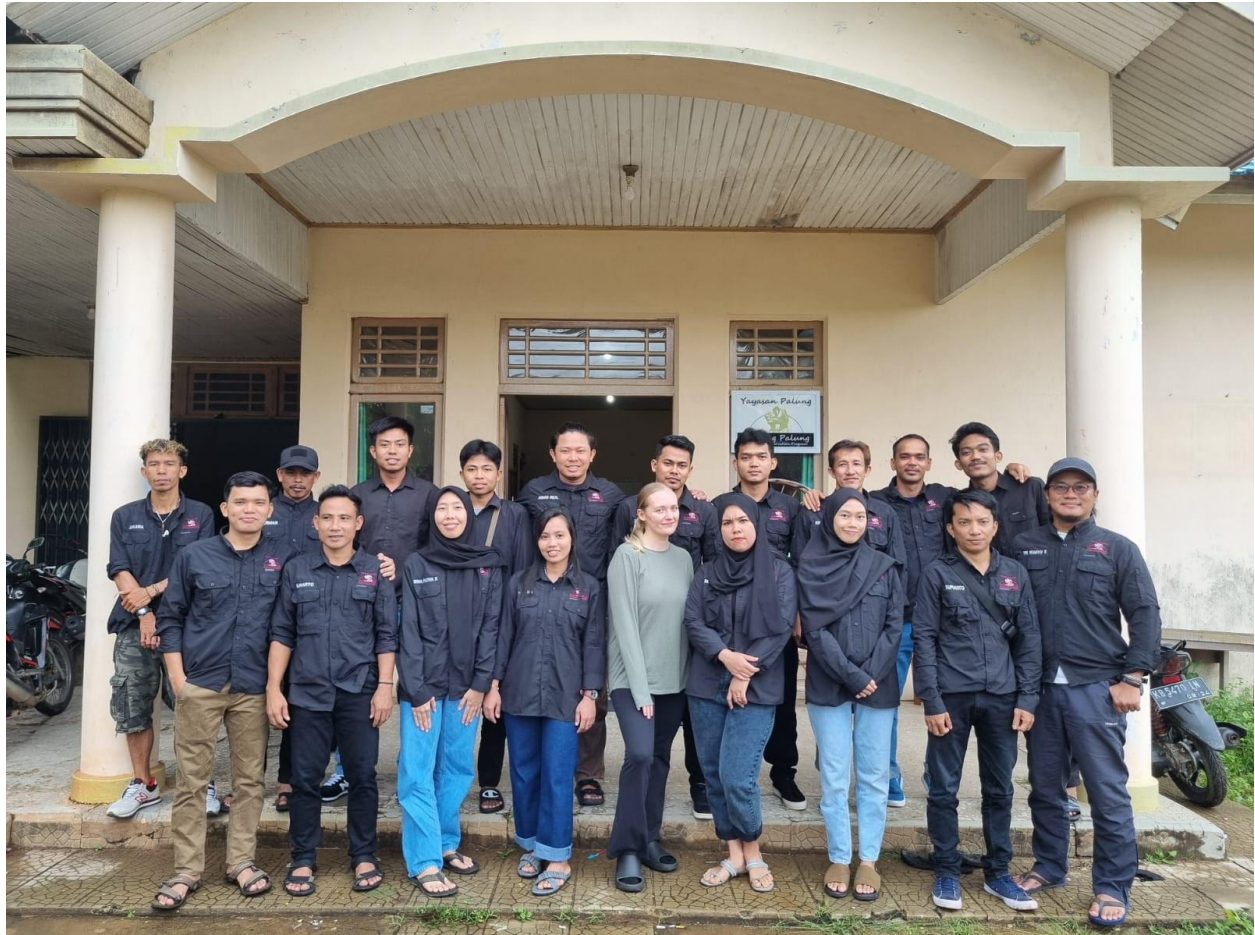
The research team at the Annual Meeting in January 2024.

Time seemed to fly by as I was enjoying my role so much, and in 2023 I accepted new responsibilities as Assistant Research Manager. Much of my work was the same as before, but my responsibilities for the botanical data and documenting orangutan foods grew. Orangutans are frugivorous animals that prefer to eat fruit, but they also eat tree bark, young leaves, old leaves, flowers, grass and insects. Learning about the diet of orangutans helped me to learn so much about the forest as a whole.