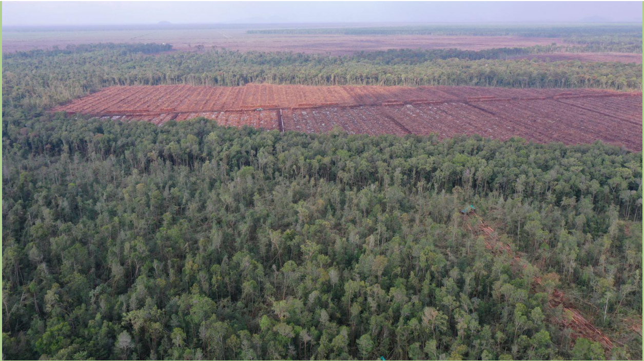
Land clearing by PT Mayawana Persada near the village forest area.

This recent letter addressed to PT. Mayawana Persada is a very promising development in ceasing the environmental damage that has been done in the area recently, but now, it is necessary to make sure that PT. Mayawana Persada obeys and follows through on the directives. Supervision must be carried out by all parties, both the government (central, provincial, district), conservation institutions and activists as well as communities around PT. Mayawana Persada.