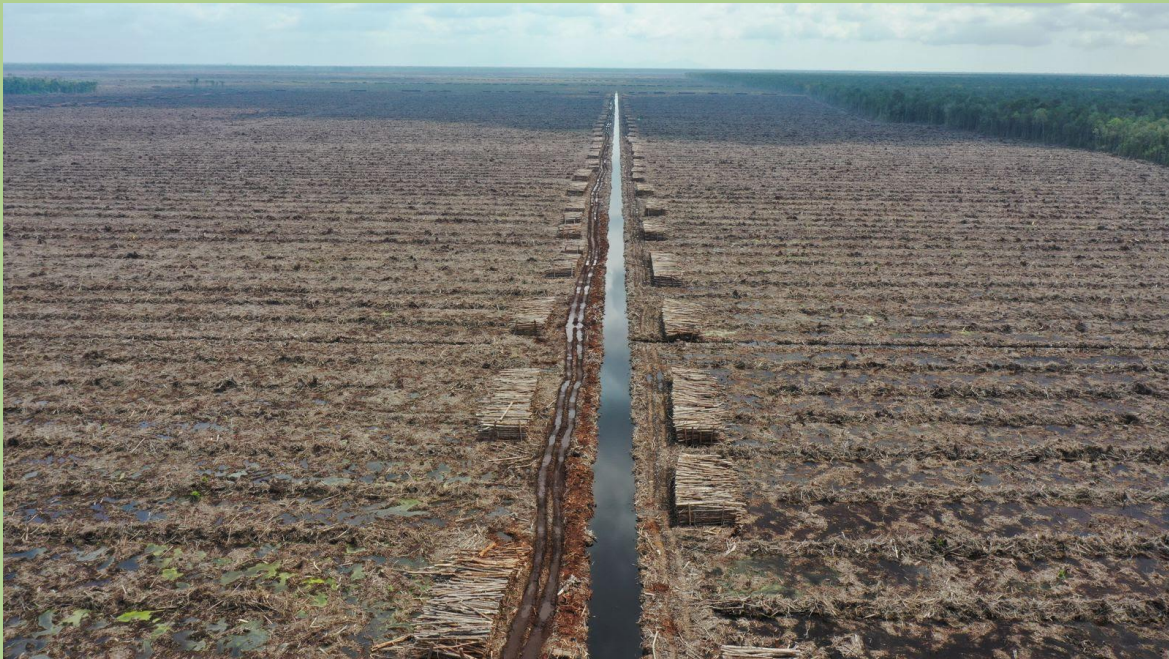
Land clearing by Mayawana Persada in the Mendawak Landscape.

This recent letter addressed to PT. Mayawana Persada is a very promising development in ceasing the environmental damage that has been done in the area recently, but now, it is necessary to make sure that PT. Mayawana Persada obeys and follows through on the directives. Supervision must be carried out by all parties, both the government (central, provincial, district), conservation institutions and activists as well as communities around PT. Mayawana Persada.