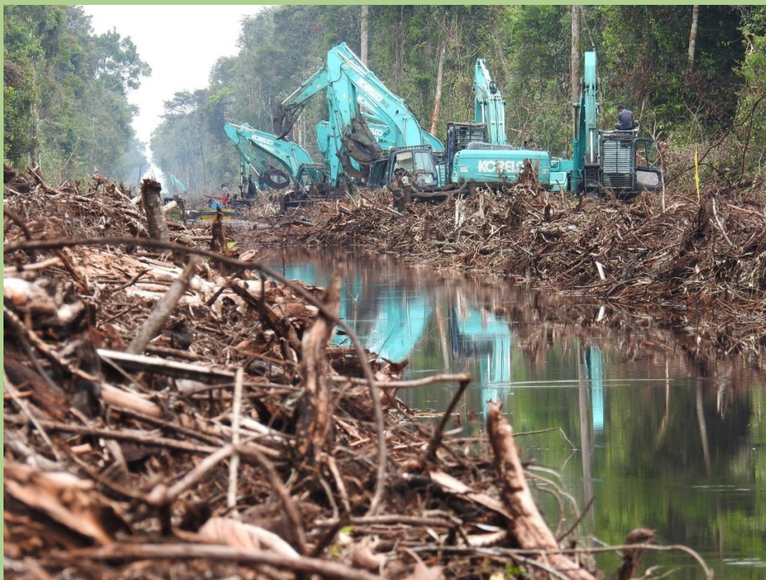
Machinery clearing forest just outside the village forest area.

Sungai Paduan, which some refer to as the Mendawak landscape. During a biodiversity survey of the village forest area, Yayasan Palung and the LPHD could hear the long calls of orangutans coming from the direction of the concession and several orangutan nests were observed. Hornbills and other animals were also seen on the PT. Mayawana Persada land. Thus, it is very unfortunate that when the Padu Banjar and Nipah Kuning Village forest patrol teams were patrolling in early March 2024 in the village forest area directly adjacent to PT. Mayawana Persada, they observed the company carrying out land clearing activities in areas indicated as habitat for various species of protected animals, including orangutans.