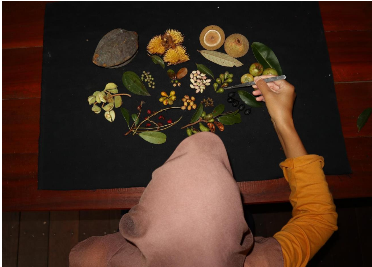
Documenting the fruit eaten by orangutans in one month.

Then, in 2018, I returned to SRCP to collect data for my thesis on Ficus spp. (figs). I continued to learn how to be a researcher in the wilderness here, preparing a study, collecting data for the orangutan project, and managing my own project data. In December 2019, I graduated from college and was offered a one-month internship at SRCP, which was followed by an official offer to join the research team in 2020 as a laboratory assistant. At first, I doubted whether I could live and work in the forest but decided to push all doubts aside and go for it.